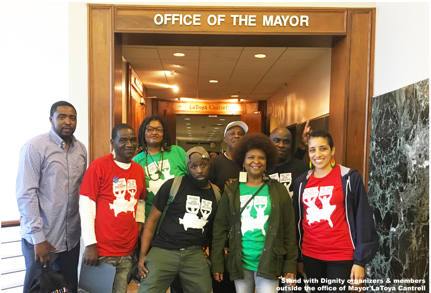
Stand with Dignity organizers & members outside the office of Mayor LaToya Cantrell

Stand with Dignity offers the following recommendations to City Council to repair the harm that the current system has caused to poor and working class Black New Orleanians. We have an opportunity to lead the nation, and invite the New Orleans City Council to take bold action to lead with us.